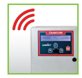
Active monitoring with alerts informs operators when critical issues arise.