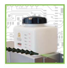
Quantify your lubrication with digitally controlled output.