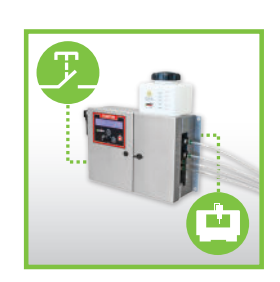
Control the Quantum™ with simple inputs or integrate fully through a robust serial interface.