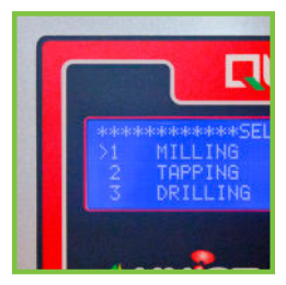
Setup, store, and select multiple jobs with the Quantum's™ simple user interface