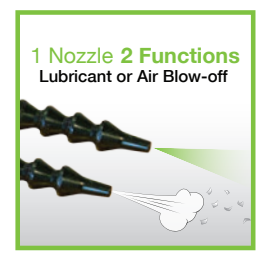
Dual use nozzle performs as both lubricant output and air blow-off to clear chips