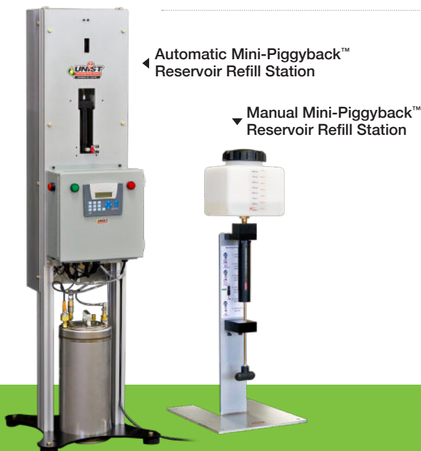
Automatic Mini-Piggyback™ Reservoir Refill Station