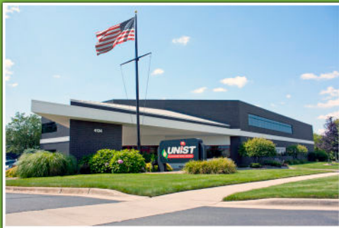
Unist headquarters in Grand Rapids, Michigan