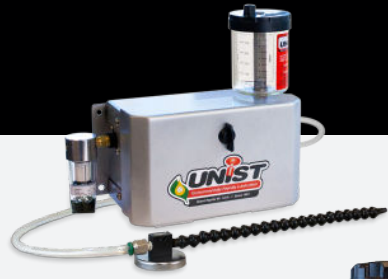
Coolubricator™ and Serv-O-Spray™ systems available with multiple outputs