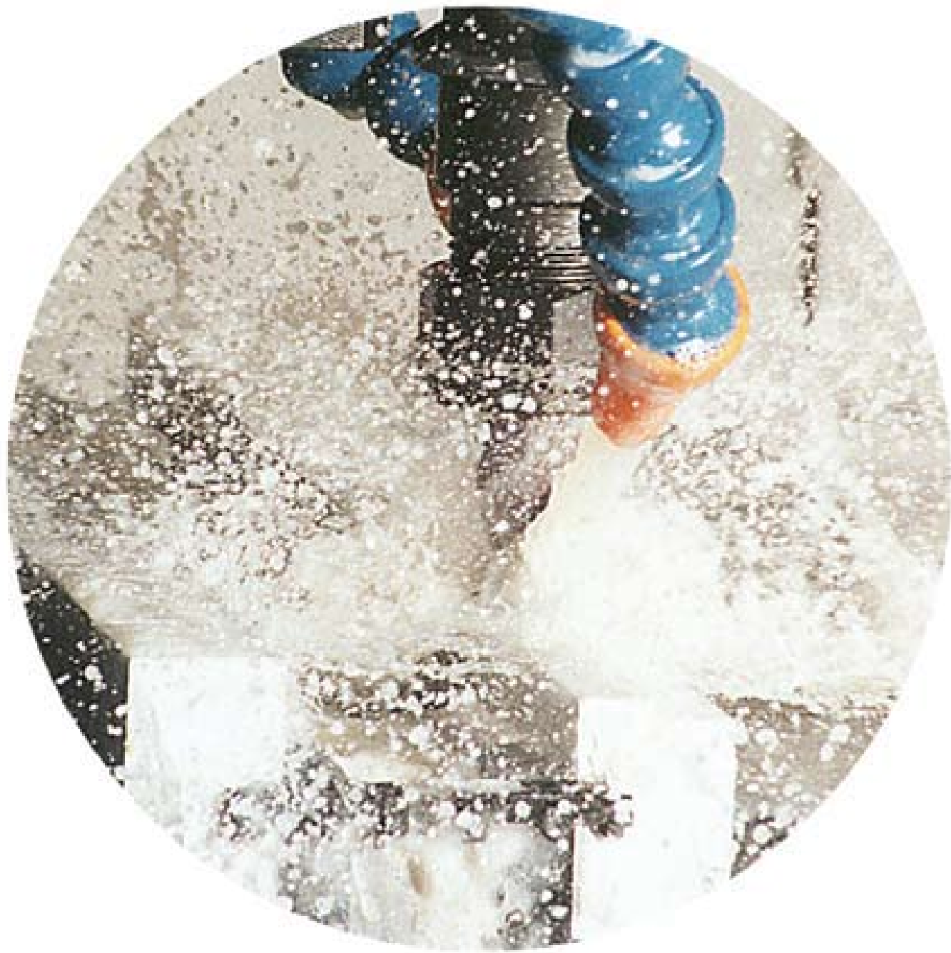
The OLD way